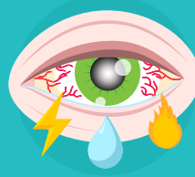
New side effects