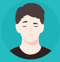
Reduced quality of life