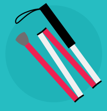
Loss of vision