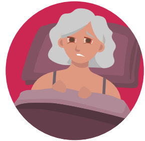
Poor quality of life

PHYSICIANS AND PATIENTS, NOT INSURANCE COMPANIES, should determine which treatment works best.